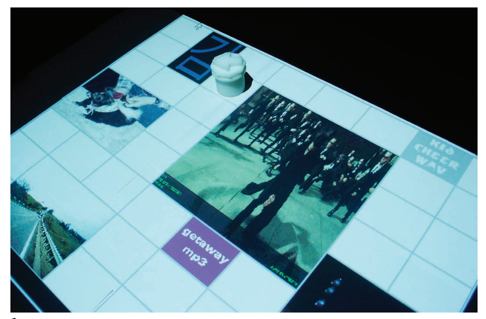
1 Close-up of the StorySpace board in its design mode.