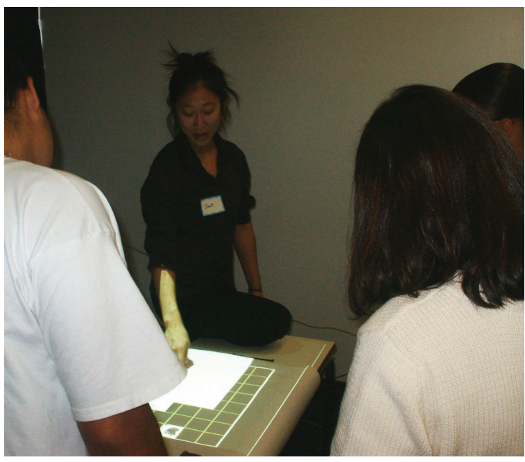
3 Students learn how to use StorySpace.

The StorySpace board is unique and currently still a