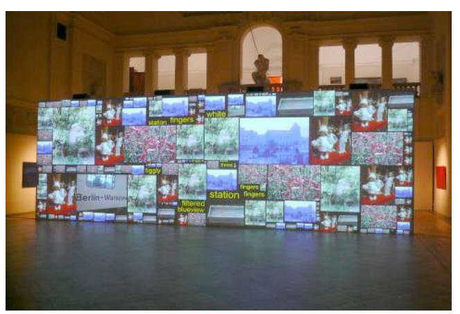
Fig. 6: A photo of the Cell Tango project, installed in Poznan, Poland, showing the 'Cell Bin' visualization.

Data Flow is an installation commissioned by Gensler Design for the Corporate Executive Board (CEB) Corporation in Arlington, Virginia. The project consists of three visualizations that map time-based communication exchanges between "members" (that is, users of the CEB website) and the CEB document repository. The artwork location was predetermined