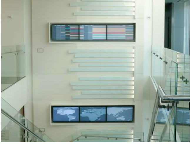
Fig. 7: A detail of the three-story Data Flow project, installed at the Corporate Executive Board headquarters.

uses the language of spreadsheets and infographics to provide a creative yet functional overview of trending user activity.