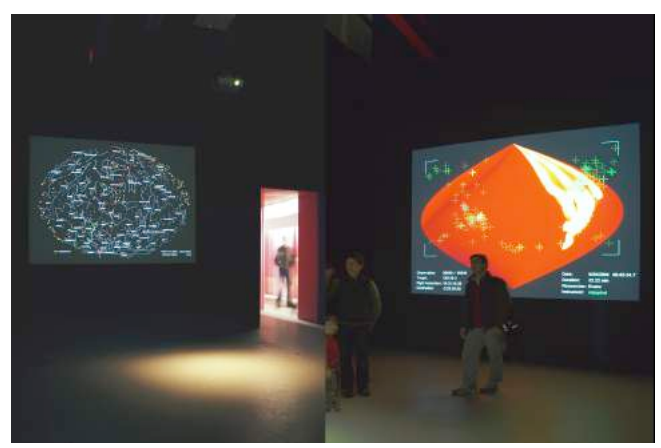
Fig. 5: The We Are Stardust installation with visitors viewing the two different projections of the observed telescope data.

selects the most recent images in the database on the screen using an algorithm that scales the images. It then places large images first and gradually fills in blank spaces with smaller images until all of the empty screen spaces are filled. 'Cell_Clusters' consists of displaying thematic clusters of images based on contributors' tags. The tags are placed around each of the incoming contributed images, which are differentiated with a yellow frame. The 'Cell_Burst' animation places images on the screen that then open like bursting fireworks. Tags are positioned once the image appears, followed by the retrieved Flickr images that are associated with each tag, creating a series of network structures indicating the software's trace through the image database. 'Cell_Finale' concludes the visualization sequence by simulating a random throw of the full collection of submitted images on the screen.