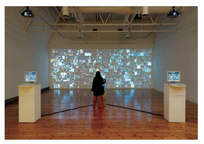
Fig. 1: A photo showing a gallery visitor contributing data to the Pockets Full of Memories installation

The visual component of Pockets Full of Memories is featured on a large cinematic projection that displays a 2D map divided into a 12x32 matrix of 384 cells. Four animated visualizations feature the data in different ways, with the most recent contributions highlighted by bright yellow frames. The first visualization shows the objects and their relocation to new positions as the algorithm recalculates. This is followed by a visualization that shows lines indicating displacement for all objects; the greater the number of objects in the archive, the more active the visualization becomes due to the increased displacement of objects. A third visualization presents a textual description of each object along with the name of its contributor. Finally, a fourth visualization colors each cell with a shade of grey to indicate its relative similarity to neighborhood cells. In this animation, light-colored cells represent clusters with similar values, whereas darker cells act as cluster separators that denote semantic distance, resembling mountain ranges that separate valleys.