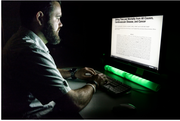
Figure 1. The HealthBar installed below the monitor of an office worker.

four inches. The bar will remain into this state until the user takes a break. However, if no break is taken, the bar will start pulsing twice every 5 minutes as a reminder for breaking up the prolonged sitting. A picture with the HealthBar at 50% charge can be seen in Figure 2 and at 25% in Figure 3.