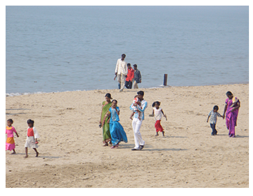
Figure 1. Families strolling on the beach.

Regardless of either of these or any other reasons, the memories of India constantly visit me. I remember the sounds, I remember the smells. But most of all, I remember the colors. Unlike many other countries, India boasts of an array of hues throughout its landscapes, architecture, food, people and much more.