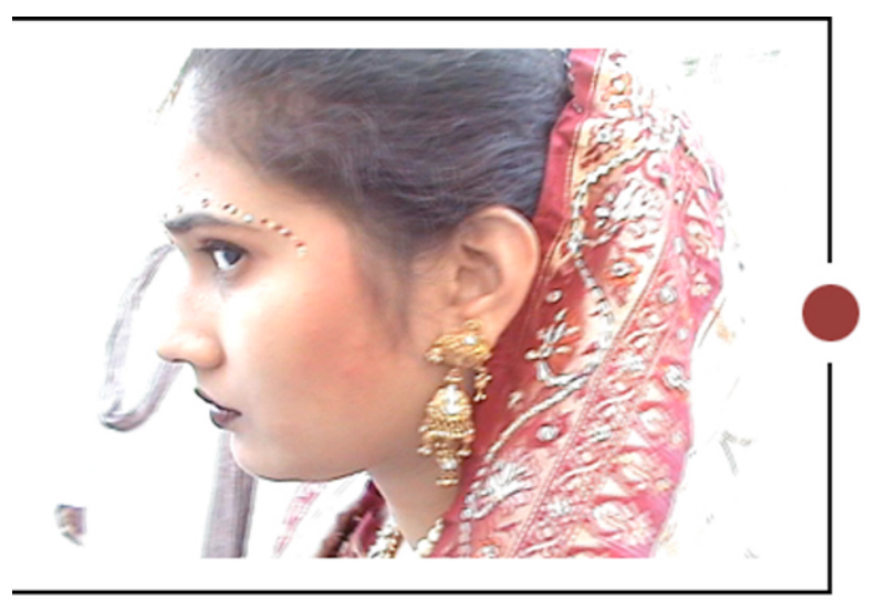
Figure 8. Color/memory association.

At this point, Computer 2 snaps an image from the video capture, displays it for seconds before it fades back to the webcam visuals. This sequence of events creates a photo-like quality of the actions and images in the space giving a viewer a memory of his own that has contributed to triggering my memory.