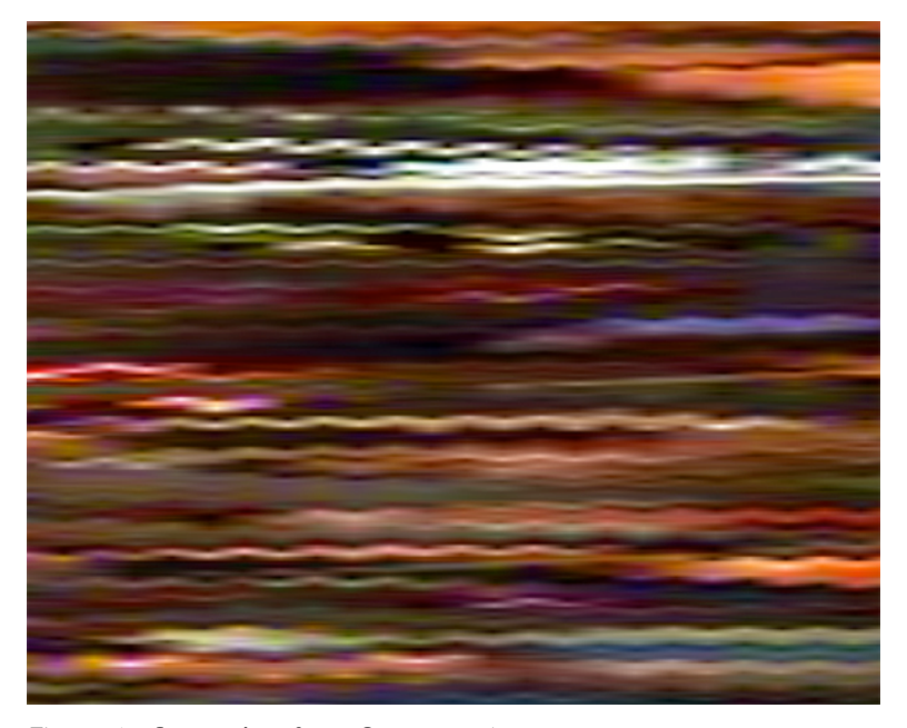
Figure 6. Screenshot from Computer 1.

through time (Fig. 6). This visual provides for a colorful and serene backdrop to the other two more active screens creating a balance to the presentation as a whole.