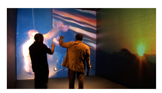
Figure 11. Thesis Exhibition

threatening at the same time as I observed that people were reluctant at first to go "inside" or preferred to watch as a spectator.