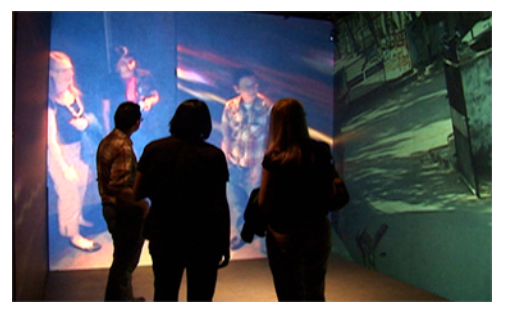
Figure 10. Thesis Exhibition

On July 6, 2006, I exhibited the final version of Cue. The event was part of a monthly schedule of meetings organized by the Open Node group. Open Node is a collective of Chicago based artists, teachers, students, curators, gallery owners, and overall art lovers who get together once or twice a month networking to bring our city to the latest art front. Each meeting typically consists of two presentations by members of the group or visiting artists. This way we are able to get to know each other and receive helpful feedback on our artwork and research.