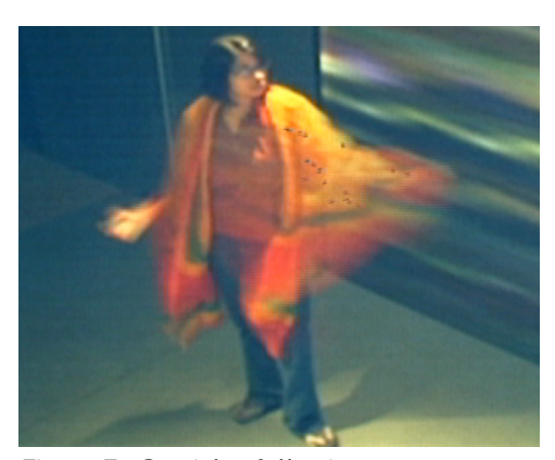
Figure 7. Particles following movement

Computer 2 is the catalyst to the whole process. Cue comes to life when a visitor