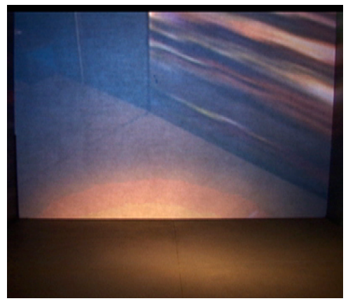
Figure 9. Lighting

As mentioned before, Cue was setup using three 10x10ft. surrounding rear projection screens. All three screens were projected on using Christie Digital Systems' Mirage 5000 projectors. The projections bounced off a large mirror onto the screens to create large scale images. The application itself was run by three Windows XP machines.