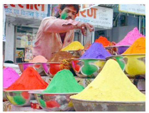
Figure 2. Holi, The festival of colors.

they saw 10 people in a row wearing colors that were not black, gray, or blue? The people of India seem to thrive on the vibrant dyes of their clothing (Fig. 1). Even panhandlers, found everywhere in India can brighten a vision with their own worn but intensely saturated clothing.