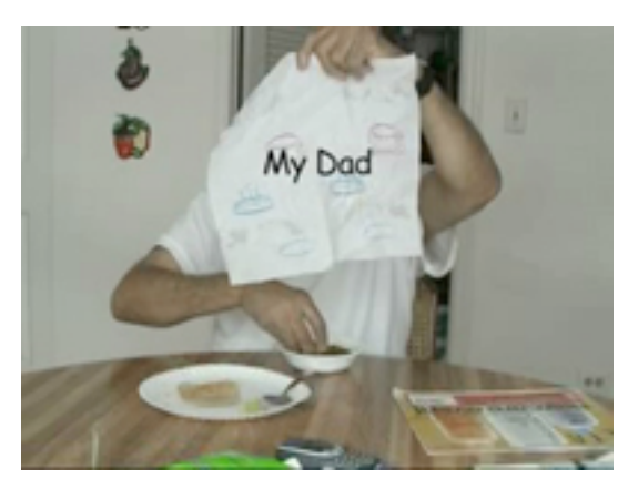
Figure 4A. My Dad, an artwork on reenactment