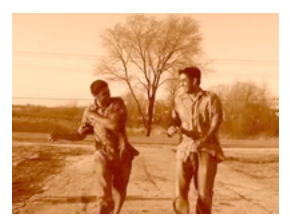
Figure 4B. My Dad, an artwork on reenactment.

Research on simulation and reenactment theories have helped in developing the initial concept of Cue and is motivation to continue with the details of the different facets of these subjects to progress in further related artworks.